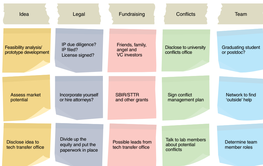
Fig. 1 | A bioentrepreneur's to-do list. At every step of the journey, there are tasks that must be tackled.

Now both you and the institution are ready for the next stage of startup company creation. A set of subsequent questions now arise (Fig. 1). These can be answered one by one, or concurrently, or in pretty much any order you choose, depending on the resources available to you and the stage of the technology.